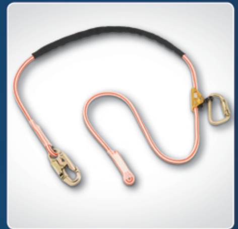
1234070 Adjustable Rope Positioning Strap (Meets OSHA 1910.268(g), 1926.502(e), & 1926.959)