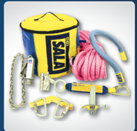
2104800 SafLok™ Pole Anchor System Meets ANSI Standards—USA