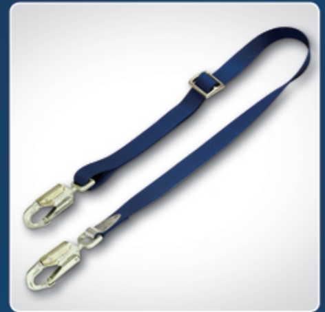
1234030 Adjustable Web Positioning Strap